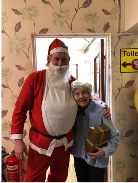
The residents celebrating New year together.