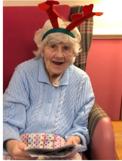
Christmas Carol and Father Christmas visited the residents.